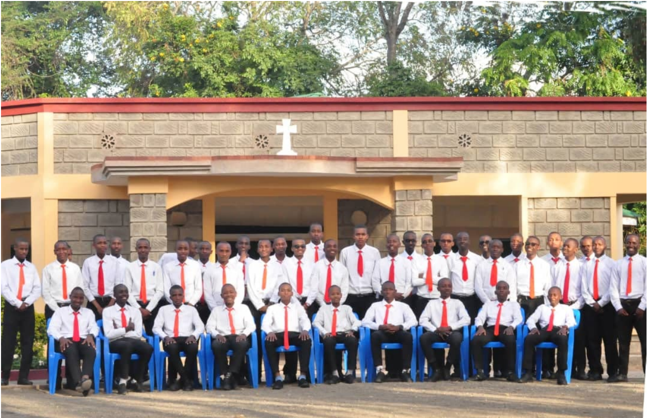
First Form IV graduating class, 2023

50 YEARS ON...FROM NOVITIATE THROUGH PRE-PHILOSOPHY TO USA SEMINARY