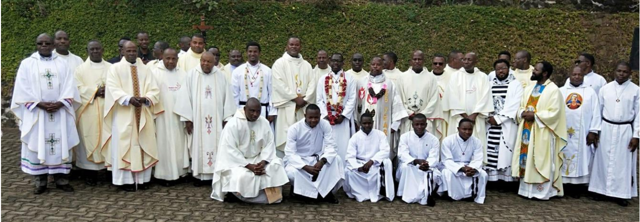
Group picture after Mass