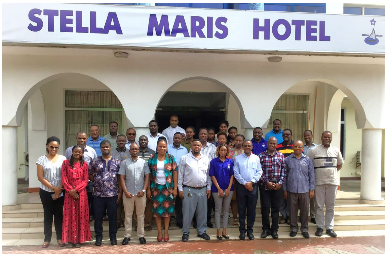
Participants: management teams of our institutions and the Provincial administration

“The General Council and the circumscriptions will ensure the efficient application of the ethical standards in economic and financial matters. The obligation of control on the part of the circumscription administration and the obligation of accountability on the part of communities and works must be strictly applied. The bursar of the circumscription will present a consolidated report of the circumscription, communities and works. The circumscription council must examine and approve this report. (Bagamoyo 2021, 15. (SRL 246.1.21).”