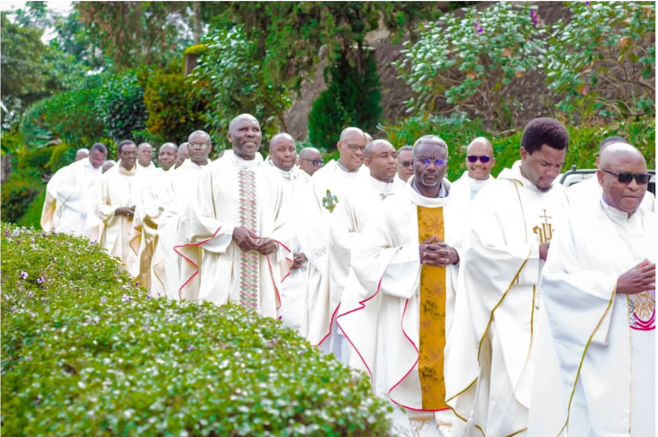
Jubilee Mass procession

On 15 August, feast of the Assumption of the Blessed Virgin Mary, we had a colorful jubilee celebration at the Provincialate, Tengeru. Our jubilarians were: