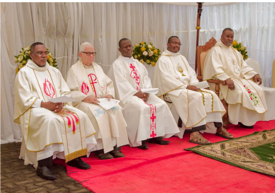
Attentive to the homily