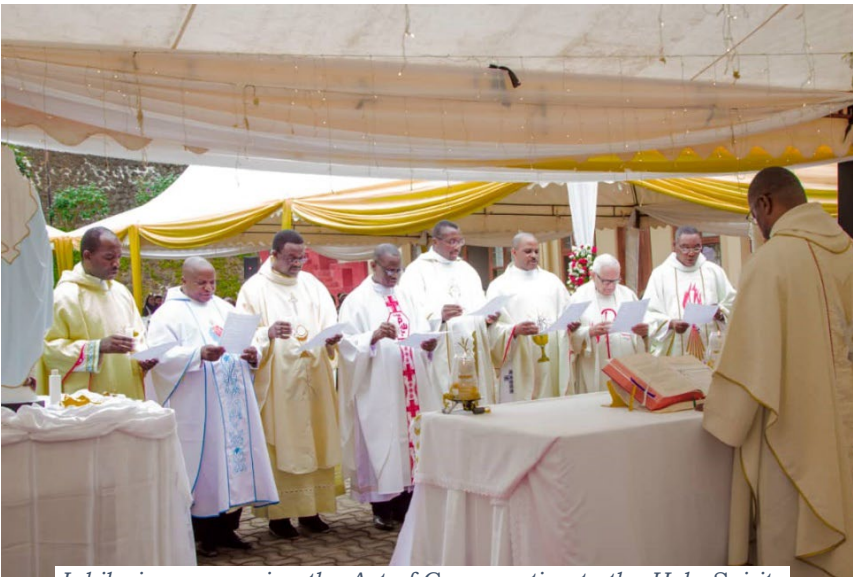
Jubilarians renewing the Act of Consecration to the Holy Spirit