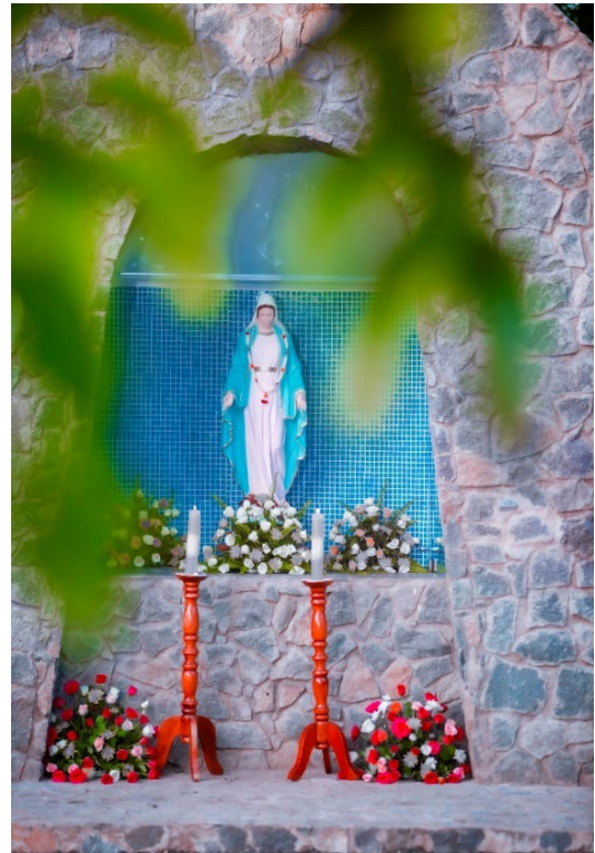
Mother Mary Companion of Missionaries Grotto at Usa river, Arusha, was blessed on 1 May, 2024.