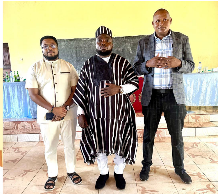
Feast of Pentecost: Modeco pastoral team