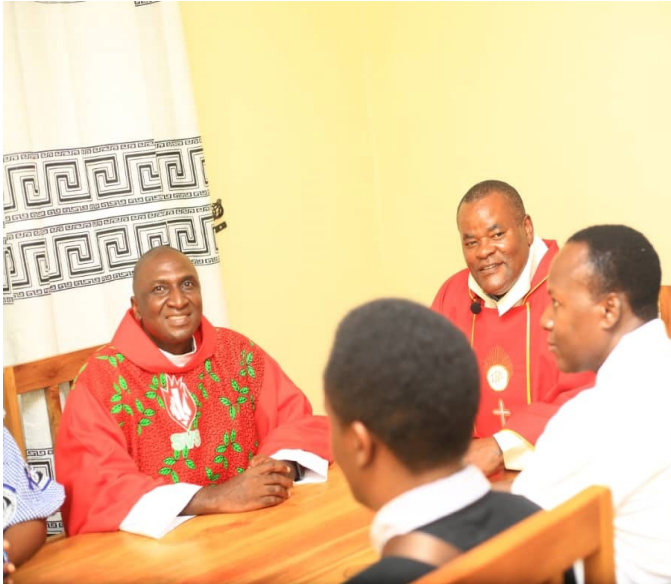
Usa river parish: a little pause in the just inaugurated VIWAWA studio