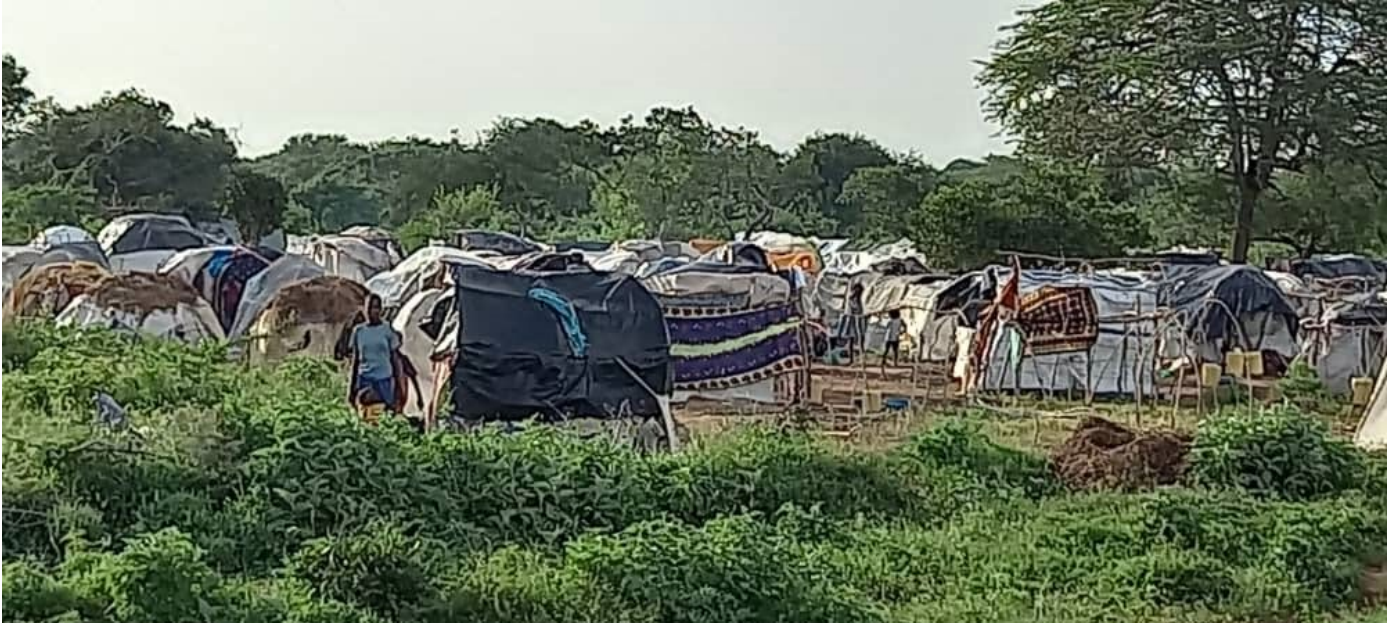
Makeshift settlements of the displaced victims of Tana river floods

Pokomo community. The Parish has 10 Small Christian Communities (SCC) each with about 10 to 15 families each.