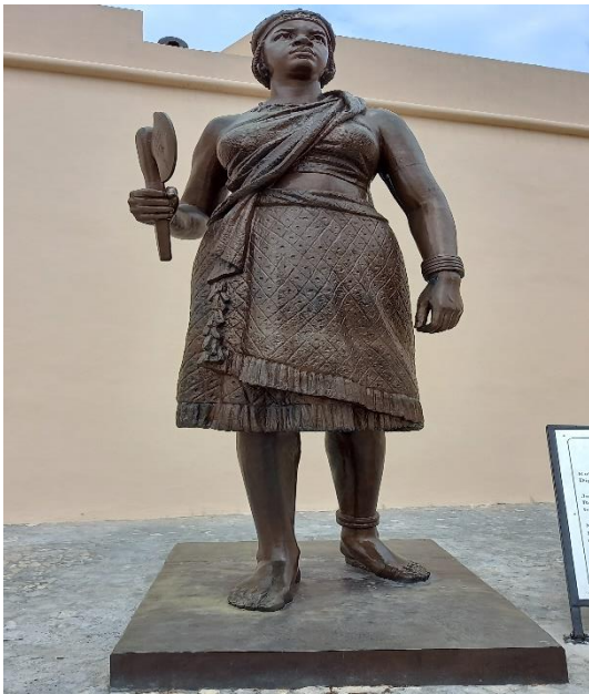
Bronze statue of Queen Nzinga Mbandi towering over in the compound of the museum. She fought for the independence and stature of her kingdoms against the Portuguese in a reign that lasted 37 years. In the years following her death, Nzinga has become a historical figure in Angola and in the wider Atlantic Creole culture