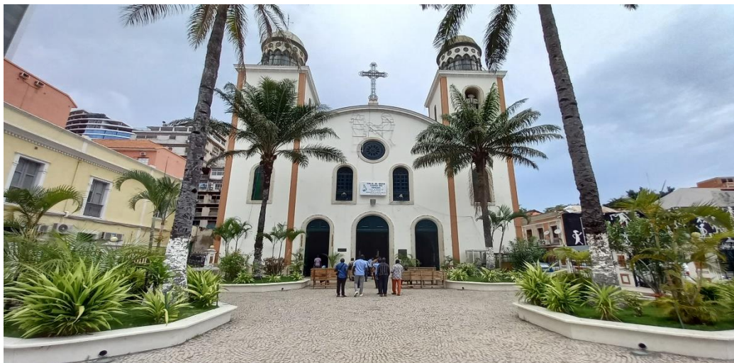
Our Lady of Remedies Cathedral (1628) situated in the business district of Luanda