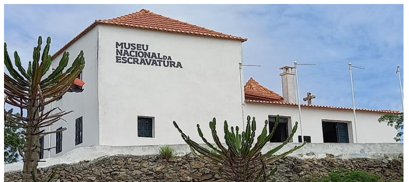
National slavery museum