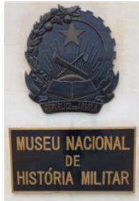
R-Entrance of the museum of the armed forces