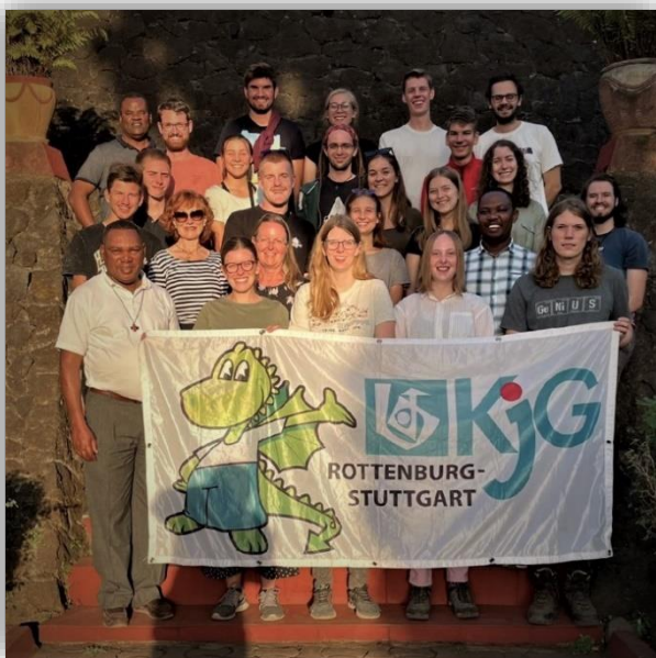
Youth group from Germany on visit in Tanzania