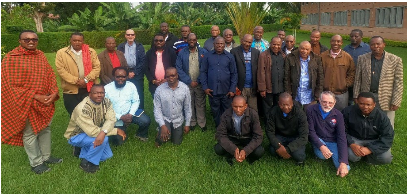
Carolus Retreat Centre: 3rd Group Retreat participants