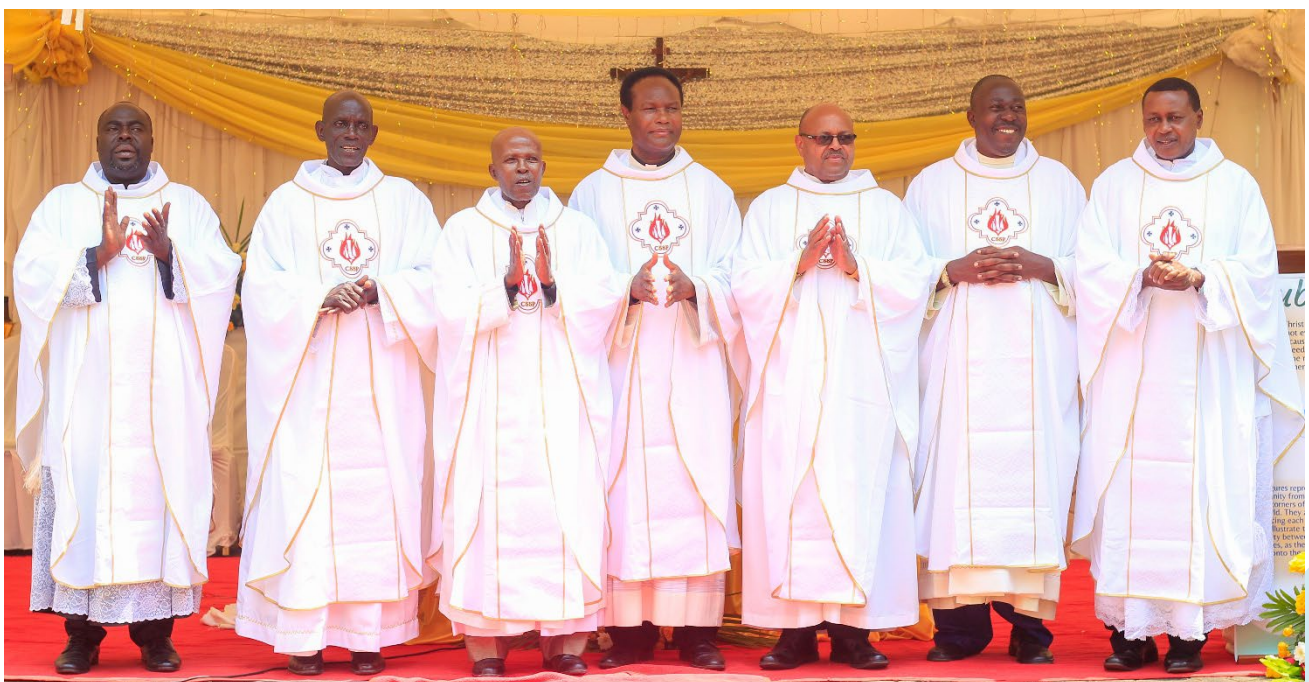
Provincialate: 14 August, 2025: 25 years of Religious life and Priesthood Jubilarians