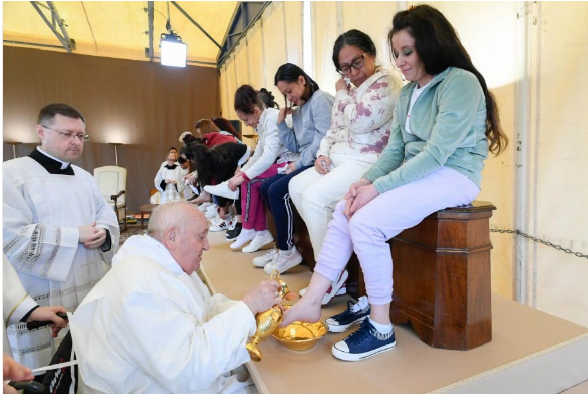
Holy Thursday 2024