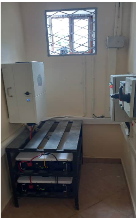
Lithium-ion batteries, inverter and switch boards

For years, the Provincialate at Tengeru grappled with frequent power cuts and voltage fluctuations which was a frustrating reality on daily life. Household appliances and office equipment rarely lasted their expected lifespans, leading to significant losses each year. The unreliable power supply affected not only the residents but also our visitors.