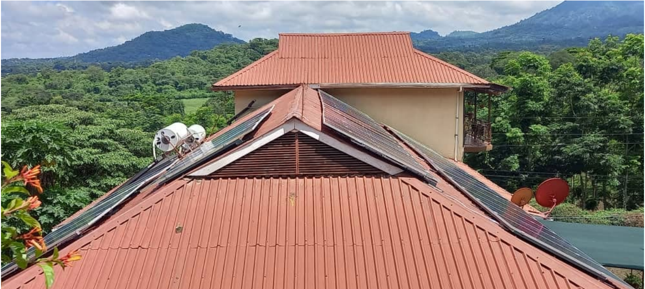
Towering solar panels on the roof