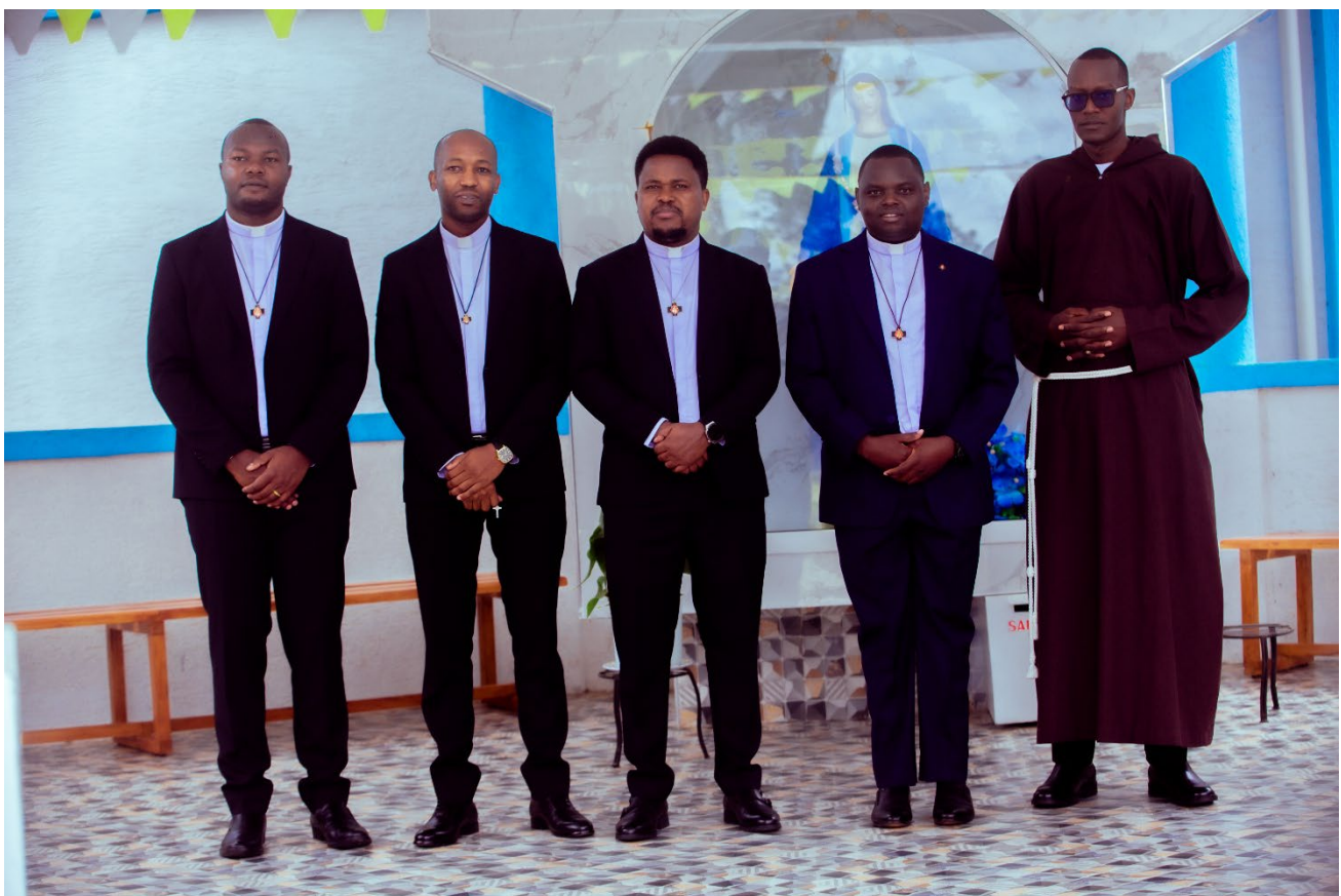
Newly ordained priests