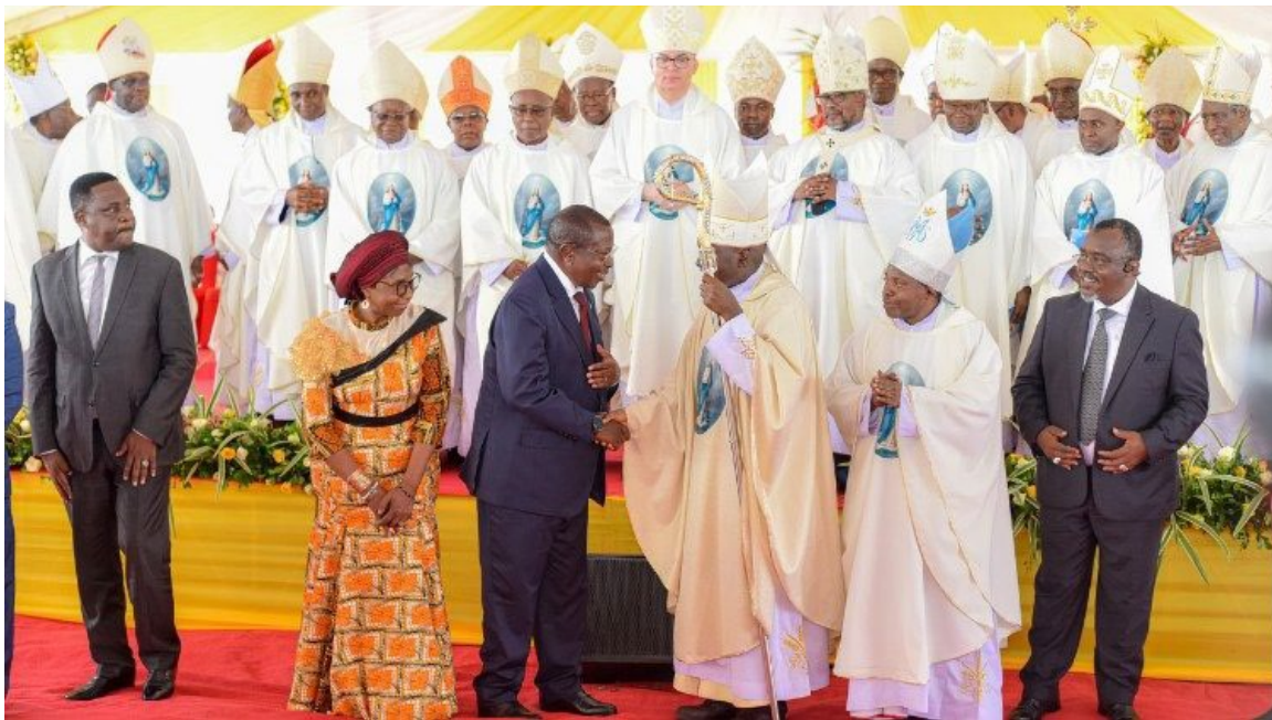
The Vice President of Tanzania, Dr. Mpango, congratulating the new Bishop at the end of Mass